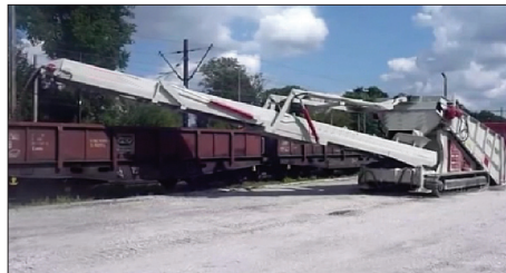
Rail wagon loading directly from trucks