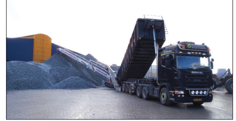
Radial stacking directly from trucks