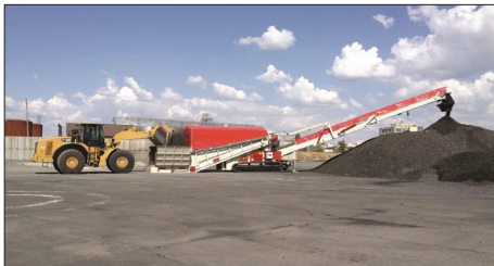
Reclaiming from front loader