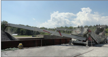
Loading barges directly from trucks