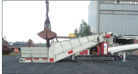
Unloading from barge directly to stockpile/warehouse